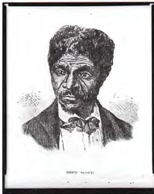
Dred Scott

Within months of the end of the Civil War, former rebellious Confederate states began passing Black Codes. These laws were designed to restrict the civil rights of recently freed African Americans. Though the 13th Amendment had ended slavery, it did not specifically assure the rights of citizenship. Congress soon passed a Civil Rights Act to assure equal civic participation and protection for black people. But President Andrew Johnson vetoed it. He believed that Congress lacked the constitutional authority to enact the law. Congress overrode the veto, but a new constitutional amendment was needed to make sure that civil rights legislation would be constitutional.