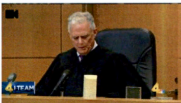
Arrest of Williamson County judge included in judicial complaint Posted Feb 1, 2017

act in violation of my constitutional rights, literally rendered me homeless and destitute within the State of Tennessee, from a comfortable middle-class lifestyle, with only a five-day notice, over a holiday weekend, when no help could be reached to prevent this horrible injustice.