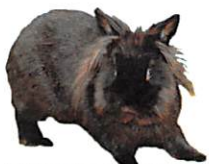
NOTHING AT ALL WAS REASONABLE!!!

(c) "Firm" or "law firm" denotes a lawyer or lawyers in a law partnership, professional corporation, sole proprietorship or other association authorized to practice law; or lawyers employed in a legal services organization or the legal department of a corporation, government agency, or other organization. (d) "Fraud" or "fraudulent" denotes an intentionally false or misleading statement of material fact, an intentional omission from a statement of fact of such additional information as would be necessary to make the statements made not materially misleading, and such other conduct by a person intended to deceive a person or tribunal with respect to a material issue in a proceeding or other matter.