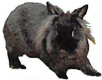
They Were BAD!

(a) "Belief" or "believes" denotes that the person involved actually supposed the fact in question to be true. A person's belief may be inferred from circumstances. (b) "Confirmed in writing," when used in reference to the informed consent of a person, denotes informed consent that is given in writing by the person or a writing that a lawyer promptly transmits to the person confirming an oral informed consent. See paragraph (e) for the definition of "informed consent." If it is not feasible to obtain or transmit the writing at the time the person gives informed consent, then the lawyer must obtain or transmit it within a reasonable time thereafter.