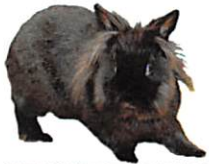
LOTS of FRAUD!

(a) "Belief" or "believes" denotes that the person involved actually supposed the fact in question to be true. A person's belief may be inferred from circumstances. (b) "Confirmed in writing," when used in reference to the informed consent of a person, denotes informed consent that is given in writing by the person or a writing that a lawyer promptly transmits to the person confirming an oral informed consent. See paragraph (e) for the definition of "informed consent." If it is not feasible to obtain or transmit the writing at the time the person gives informed consent, then the lawyer must obtain or transmit it within a reasonable time thereafter.